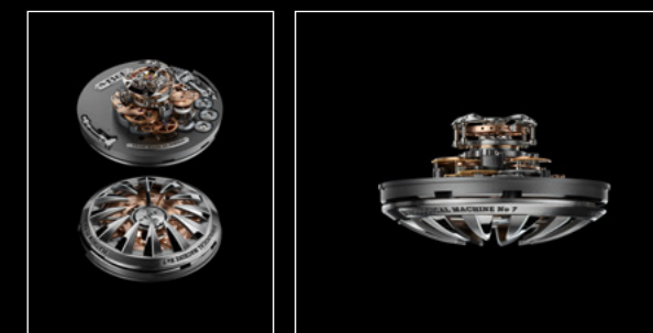
HM7 AQUAPOD ENGINE HM7 AQUAPOD ENGIN PROFILE