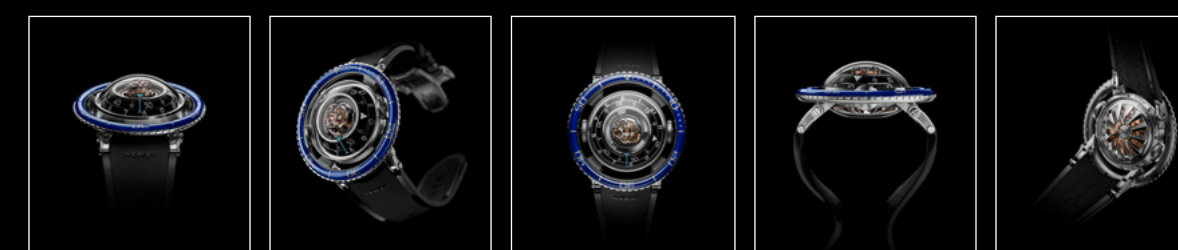
HM7 AQUAPOD TI BLUE FACE HM7 AQUAPOD TI BLUE FRONT HM7 AQUAPOD TI BLUE TOP HM7 AQUAPOD TI BLUE PROFILE HM7 AQUAPOD TI BLUE BACK