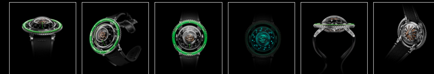
HM7 AQUAPOD TI GREEN FACE HM7 AQUAPOD TI GREEN FRONT HM7 AQUAPOD TI GREEN TOP HM7 AQUAPOD TI GREEN NIGHT HM7 AQUAPOD TI GREEN PROFILE HM7 AQUAPOD TI GREEN BACK