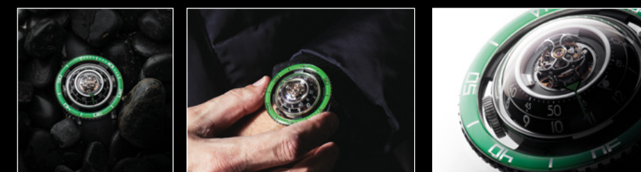
HM7 AQUAPOD TI GREEN LIVE SHOT HM7 AQUAPOD TI GREEN WRIST SHOT HM7 AQUAPOD TI GREEN CLOSE-UP