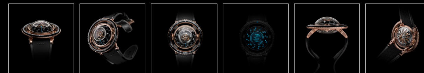
HM7 AQUAPOD RG FACE HM7 AQUAPOD RG FRONT HM7 AQUAPOD RG TOP HM7 AQUAPOD RG TOP NIGHT HM7 AQUAPOD RG PROFILE HM7 AQUAPOD RG BACK